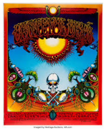
Rick Griffin's Aoxomoxoa

the artwork for years, and I remember feeling one day, like...I finally got my own record player and I put on a Grateful Dead record, I think it was Aoxomoxoa. The music to me was not at all what I expected. This is like some mellow hippie's music and I was expecting skulls and I was expecting something totally different.