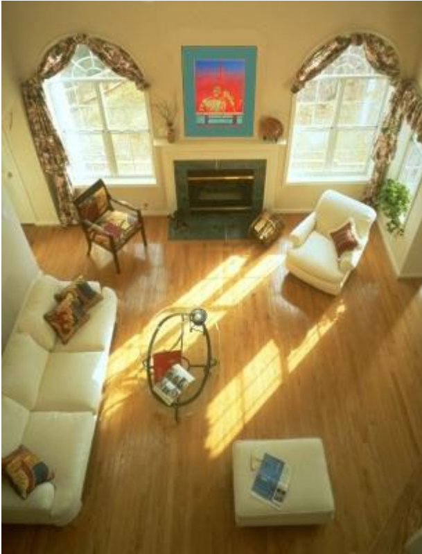
A Moscoso Adds a Touch of Elegance