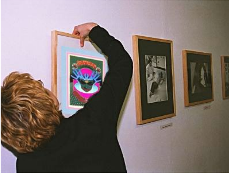
Get Them on the Wall