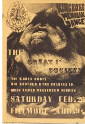
King Kong FD-002

I mean I thought I was profound when I said that. The notion that the poster, I paid a dollar for -- "The King Kong" -- might be twenty dollars; I thought that was really something. The notion that that would be three or four thousand dollars, if you had said that to me I would have said, "You're crazy."