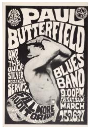
Paul Butterfield Blues Band

I was getting my Masters at Cal. in English Literature. I was walking down Telegraph Avenue sometime in the mid/late winter of 1966 and a kid handed me a handbill for one of the Family Dog events. It was either the "Love" or the "Paul Butterfield".